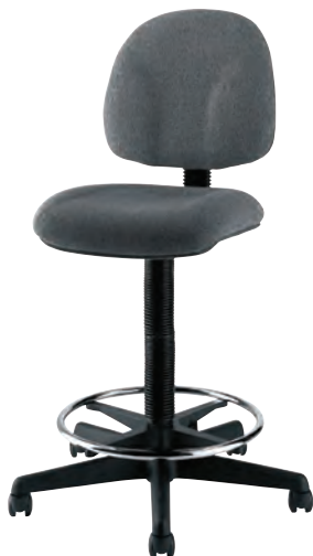
GREY GASLIFT CHAIR 71045

Telescoping height adjustment; five-caster base rolls with ease. Base à cinq roulettes et ajustement télescopique de la hauteur.