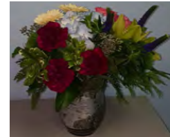
Small Vase Arrangement - Average dimensions 8" x 8" x 10"h