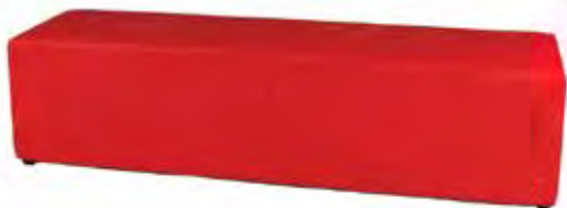
LARGE OTTOMAN GRAND REPOSE-PIED black/noir 950153