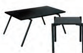
BLACK COCKTAIL TABLE 115103