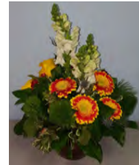
Medium Arrangement - Average dimensions 12" x 12" x 10"-12"h