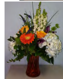
Large Arrangement - Average dimensions 12" x 22" w " x 11"-12"h or 16" x 16" x 22" h